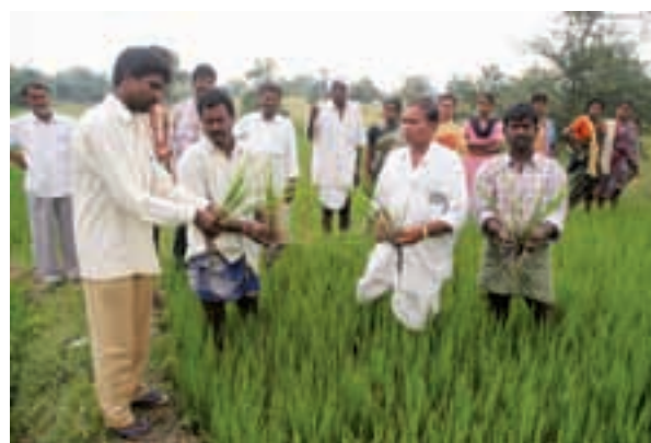
New technologies are promoted

Both APRLP and MPRLP are working in partnership with others to promote jobs and vocational training schemes. In Andhra Pradesh, 8,200 rural youths are being provided with skills and job placements through skills development, whilst another 1,512 are being trained in electronic skills areas to meet the growing demand from companies in the State.